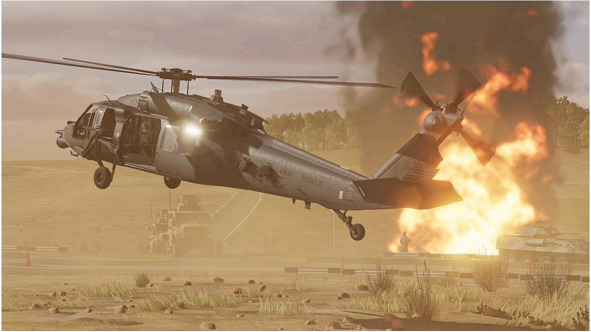
USAF HH-60G Pave Hawk - 18WG / 18OG / 33RQS PACK