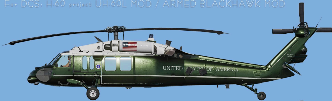
* UH-60N White Hawk - USMC Marine Helicopter Squadron One (HMX-1) - Nighthawks "163253"

For DCS: H-60 project UH-60L MOD / ARMED BLACKHAWK MOD